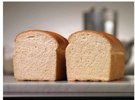
No visible difference: (left) baked with conventional wheat flour, (right) baked with SafeGuard™ treated wheat flour.

Our team of experts will work with you to understand your product needs and potential risks, then recommend the right answers to help you grow your brand and boost confidence. With our comprehensive capabilities and resources, Ardent Mills is ready to be your food safety ally.