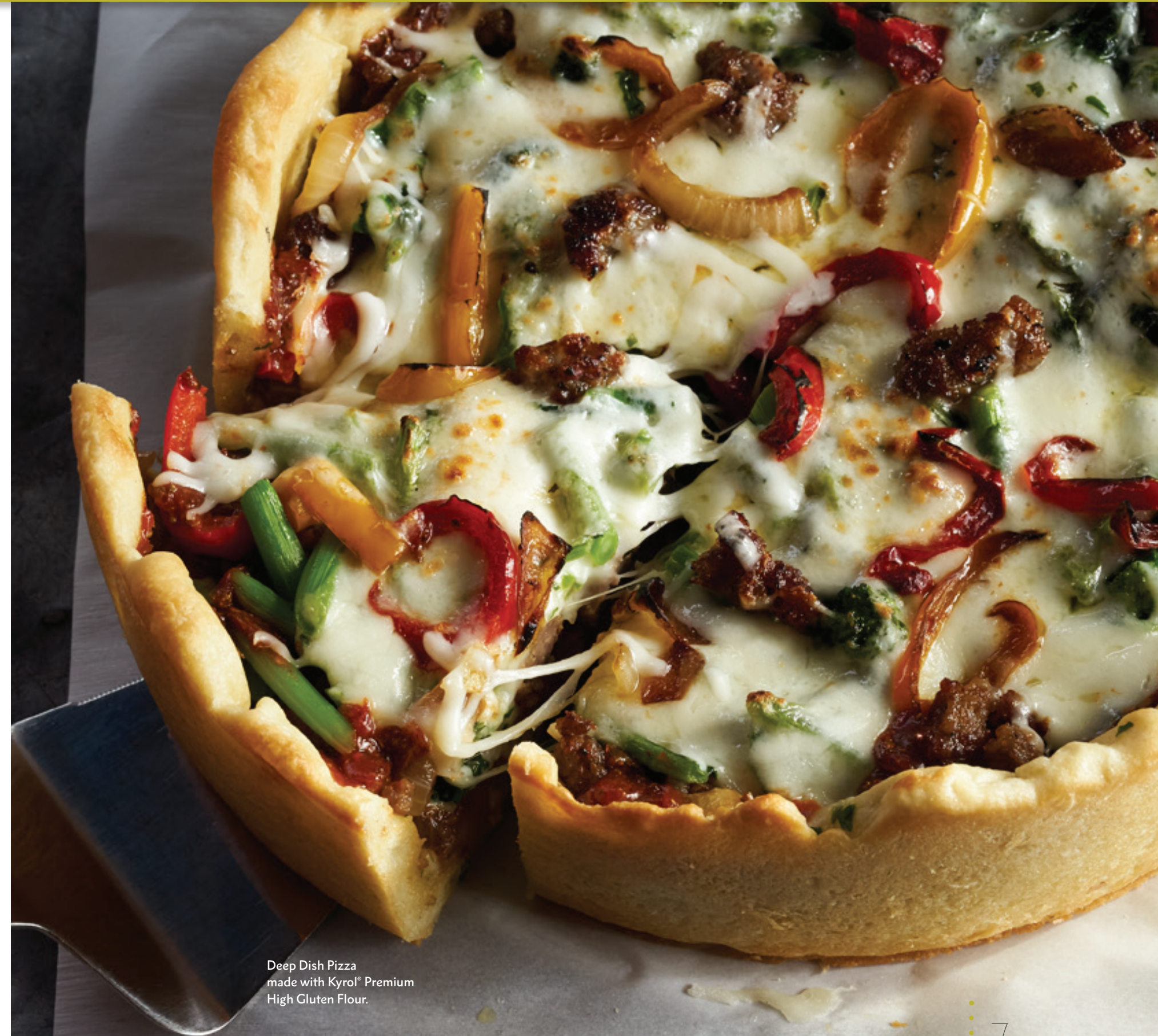
Deep Dish Pizza made with Kyrol® Premium High Gluten Flour.

National and regional grocery store chains, membership warehouse clubs, ethnic markets and discount stores.