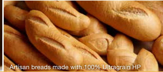
Artisan breads made with 100% Ultragrain HP