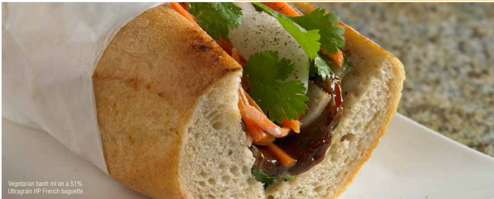
Vegetarian banh mi on a 51% Ultragrain HP French baguette

Watch a video demonstration of Ultragrain HP hydration and mixing at YouTube.com/ardentmills