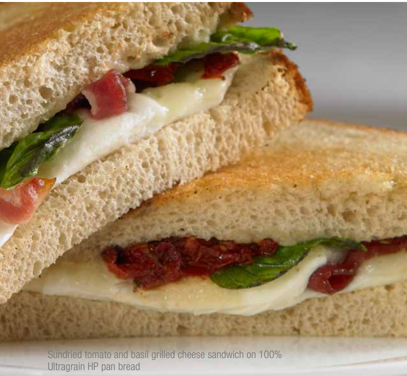
Sundried tomato and basil grilled cheese sandwich on 100% Ultragrain HP pan bread

With Ultragrain HP, your customers will enjoy all-natural whole wheat bread with white flour appeal, and your operation will book the cost savings: