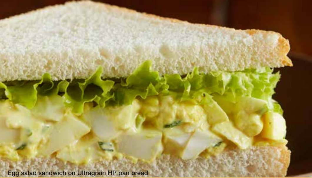
Egg salad sandwich on Ultragrain HP pan bread