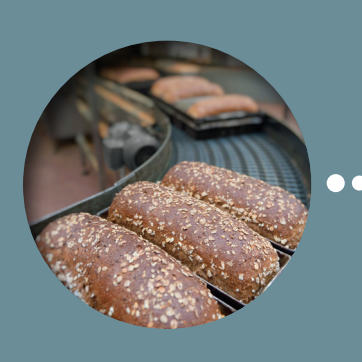
Consistent, high-quality performance