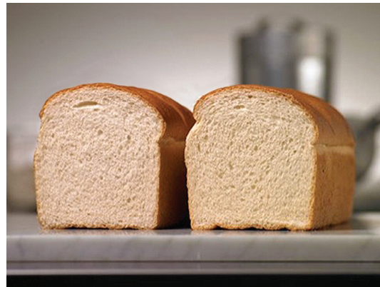
No visible difference: (left) baked with conventional wheat flour, (right) baked with Ardent Mills Safeguard™ treated wheat flour.

Our team of experts will work with you to understand your product needs and potential risks, then recommend the right answers to help you grow your brand and boost confidence. With our comprehensive capabilities and resources, Ardent Mills is ready to be your food safety ally.